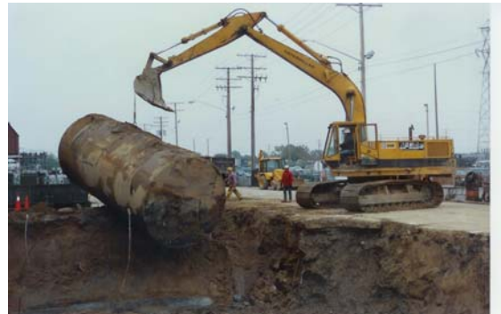
McCabe Engineering & Contracting